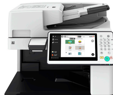
Scan2x on imageRUNNER