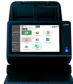
Scan2x on ScanFront